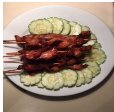
CHICKEN SKEWER 24 STICK $$36.00