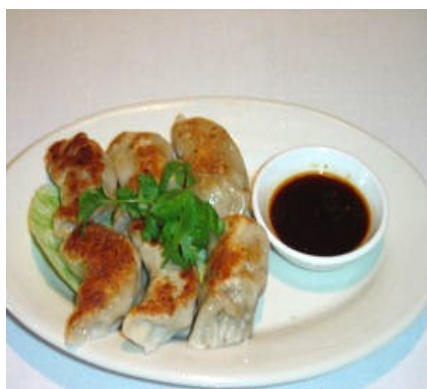
POT STICKER 24 PCS $24.00

Please call the restaurant for more information on our delivery services.