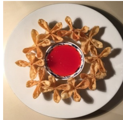
CRAB ANGEL 24 PCS $24.00

Add on a gallon tea or Lemonade Or additional pans to fit your event! Additional charges are applicable.