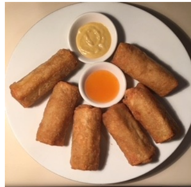
PORK EGG ROLL 24 PCS $54.00