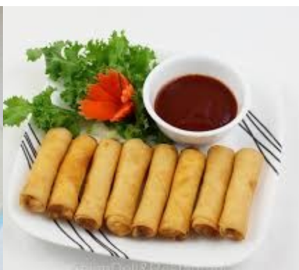
SPRING ROLL 24 PCS $67.00