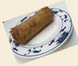
Egg Roll 3.05 Crispy fried pork egg roll