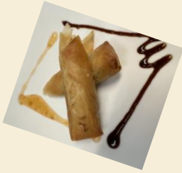
Vegetable Spring Roll 3.90 freshly made roll with vegetable Fried crispy golden brown.