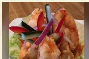
Rock Shrimps 9.99 Lightly breaded jumbo shrimp, Thai sweet chili sauce.