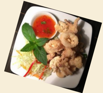
Salt Pepper Calamari 10.95 Crispy fried calamari topped With five spice salt, served With Thai sweet chili sauce.