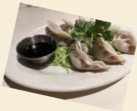
Steamed Dumplings 7.99 Handmade stuffed with ground pork, steamed, served with soy vinegar sauce.