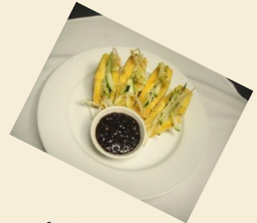
Tofu Goreng 10.65 Freshly fried triangle tofu stuffed With fresh cucumber and steamed Bean sprout, served With homemade peanut sauce.