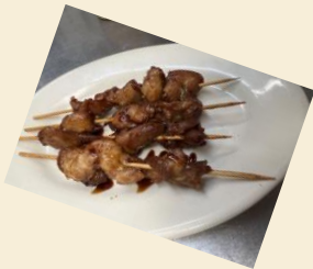
Chicken Skewers 8.75 chicken thighs skewers with homemade teriyaki sauce.