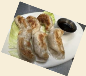
Pot Stickers 7.99 Handmade stuffed with Ground pork, pan fried, Served with soy vinegar sauce.