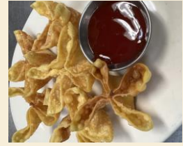
Crab Angel 7.99 Hand folded pastry stuffed with Cream cheese, Served with sweet sour sauce.