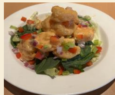
VOLCANO SHRIMPS 9.99 Fried shrimp coated with signature dressing on a bed lettuce and spinach