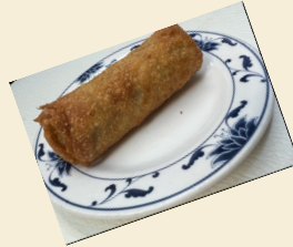
Egg Roll 2.95 Crispy fried pork egg roll