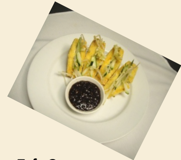
Tofu Goreng 10.25 Freshly fried triangle tofu stuffed With fresh cucumber and steamed Bean sprout, served With homemade peanut sauce.