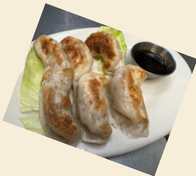
Pot Stickers 7.75 Handmade stuffed with Ground pork, pan fried, Served with soy vinegar sauce.