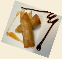
Vegetable Spring Roll 3.75 freshly made roll with vegetable Fried crispy golden brown.