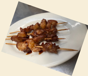
Chicken Skewers 8.15 chicken thighs skewers with homemade teriyaki sauce.