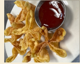
Crab Angel 7.75 Hand folded pastry stuffed with Cream cheese, Served with sweet sour sauce.