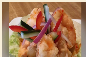
Rock Shrimps 9.65 Lightly breaded jumbo shrimp, Thai sweet chili sauce.