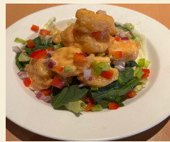
VOLCANO SHRIMPS 9.65 Fried shrimp coated with signature dressing on a bed lettuce and spinach